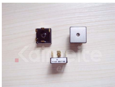
rcuits - ICs