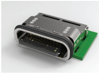
Waterproof Dual Row SMT Receptacle