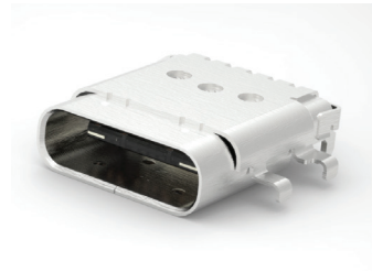
Mid-Mount Hybrid Receptacle