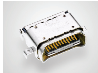
Splash Proof Dual Row SMT Receptacle